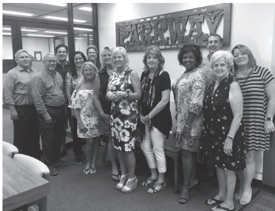
PAA Board of Directors 2018